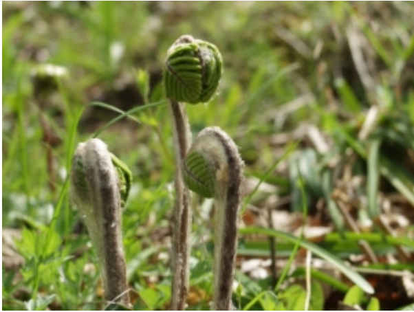
Fern Fiddleheads Emerging in Spring

Reproductive structures. Ferns are fundamentally primitive plants that reproduce by microscopic one-celled reproductive units called spores . This distinguishes ferns from flowering or cone-bearing plants. The spores are produced in sac-like structures called sporangia . The sporangia are aggregated in groups called sori (or sorus, singular) on the underside of the frond. Sori contain both egg cells and sperm cells. The arrangement, location and number of sori are used to help identify fern species.