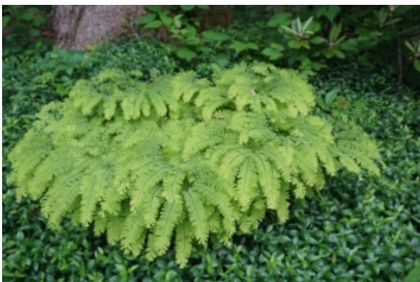
Well-Established Maidenhair Ferns

Maidenhair Fern ( Adiantum pedatum ) is one of the most elegant and graceful of our native species. A clumping species, it typically spreads slowly by creeping rhizomes in well-drained organic soil. Its bright green, 12” to 20” long, bright green, fingered fronds cascade in layers on shiny, black stems. While maidenhair fern thrives in bright light, it cannot tolerate direct sun. Once the fronds wilt from heat or drought, they cannot recover and the plant must produce new fronds. Don’t confuse this species with Adiantum tenerum or A. capillus-veneris , both of which are grown as houseplants.