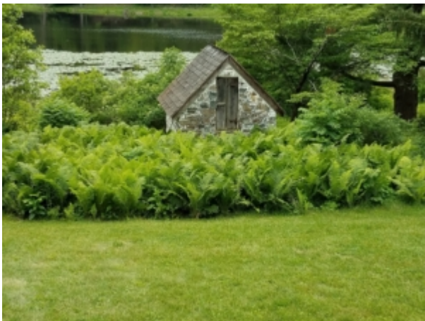
Ostrich Fern Display at Historic Welkinweir Estate in Pottstown, PA.

Ostrich Fern ( Matteuccia struthiopteris ) is one of the tallest and most impressive looking of the native fern species. Topping out at 4' to 6' tall, it has bright green, upright deciduous fronds that circle a narrow base. The brown, spore-bearing fronds, which are separate from the green fronds, harden and persist through cold weather, lending an architectural element to the winter landscape. This is the fiddlehead fern that restaurants and home cooks prize for its grassy, asparagus-like flavor. A deciduous species, ostrich fern thrives in average to moist soil and dappled sunlight. This creeper spreads by shallow, string-like rhizomes, which produce new clumps a foot or two away. It can easily naturalize in sites with dappled sunlight. In northern parts of the country, it will grow in full sun as long as it has moist soil.