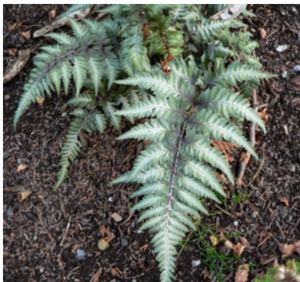
Japanese Painted Fern 'Pictum'

Japanese Painted Fern ( Athyrium niponicum 'pictum' ) received the Perennial Plant of the Year Award in 2004 from the North American Perennial Plant Association. The first fern to be so honored, this popular outstanding Asian selection is highly versatile due to its blend of silvery green and burgundy colors on 12" to 18" fronds. One of the most colorful of ferns, it shows up well in partial shade and blends well with other fern species.