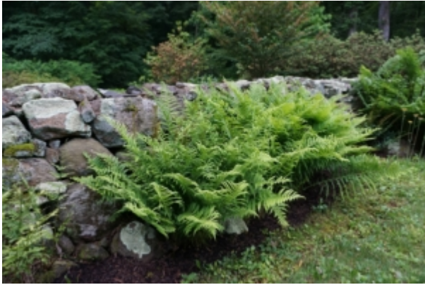
Fern Species in Natural Setting