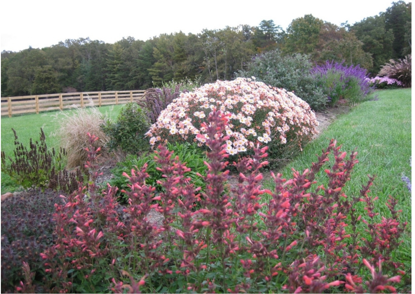
October Floral Display in Author's Garden