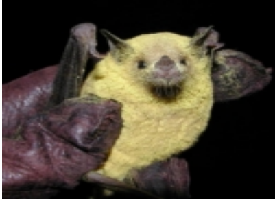
Bats not only gobble up insects that eat our crops but are also valued pollinators. This bat is covered in pollen.

Iconic Halloween animals, bats have long suffered a spooky reputation. They've been accused of harboring vampiric spirits, making nests in piles of ratty hair, and are often associated with witches, warlocks and Halloween. Few other mammals seem to spook us with so many misunderstandings. But bats, because of their incredible echolocation abilities, rarely fly into or touch people , and serve amazing and essential ecological roles in our gardens.